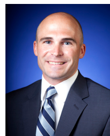
Brad Amersbach Sports Information