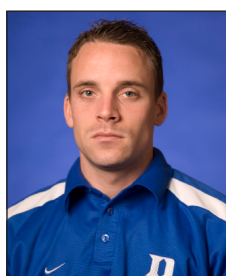
Nick Potter Physical Therapy